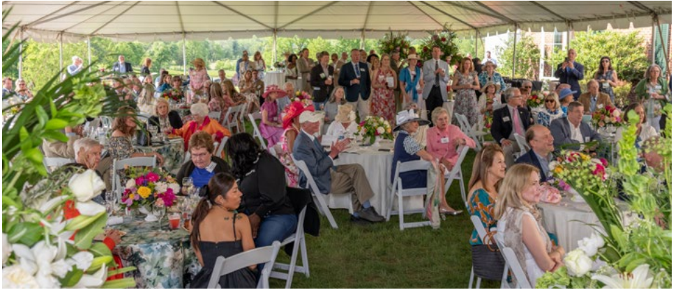
Garden party guests enjoying the ceremony for our 2025 Conservation Awards